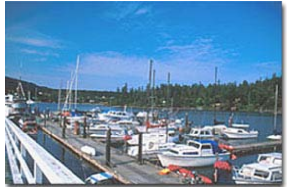
Picturesque Deep Cove Marina