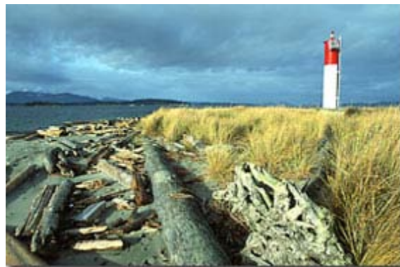
Sidney Spit Provincial Park, Sidney