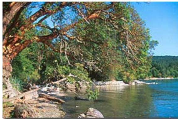
Coles Bay Regional Park, North Saanich