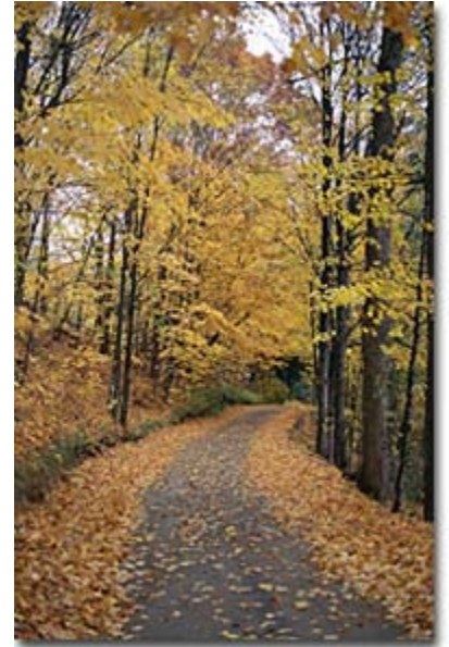
Saanich Peninsula country road in the Fall season

The Saanich Peninsula is a cyclist's paradise, with relatively quiet country roads and the Gallopig Goose Trail , which runs from Leechtown near Sooke through Victoria and north on the Saanich Peninsula all the way to the Swartz Bay Ferry Terminal. Combined with the Peninsula Trail system, this network of trails offers hikers and cyclists over 100 kilometres of scenic pathways to discover.